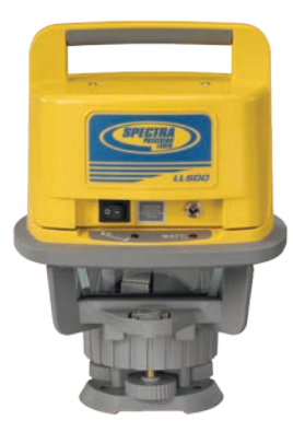
LL500 - Setting the Industry Standard