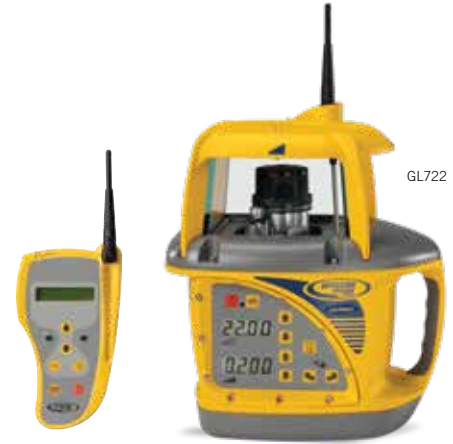
GL722 features long range radio remote control