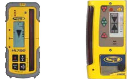
HL700 Digital Readout Receiver includes the C70 rod clamp